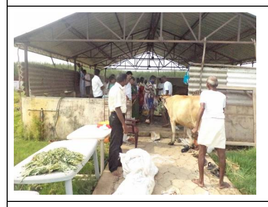
Vegetables are kept ready for the cows,