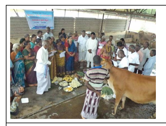
The Cow pooja was performed by the elders and invitees.