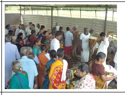
All the elders and mothers are worshiping the cows and receive their blessings.